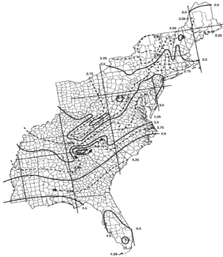
FIGURE 1106.1 100-YEAR, 1-HOUR RAINFALL (INCHES) EASTERN UNITED STATES